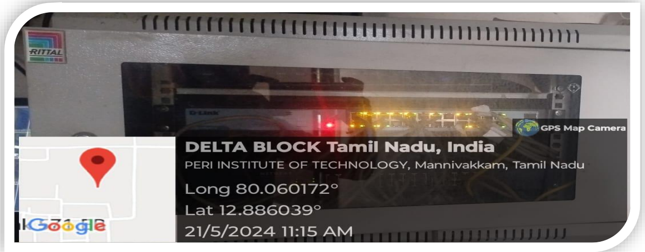
Wifi Connection - DELTA BLOCK