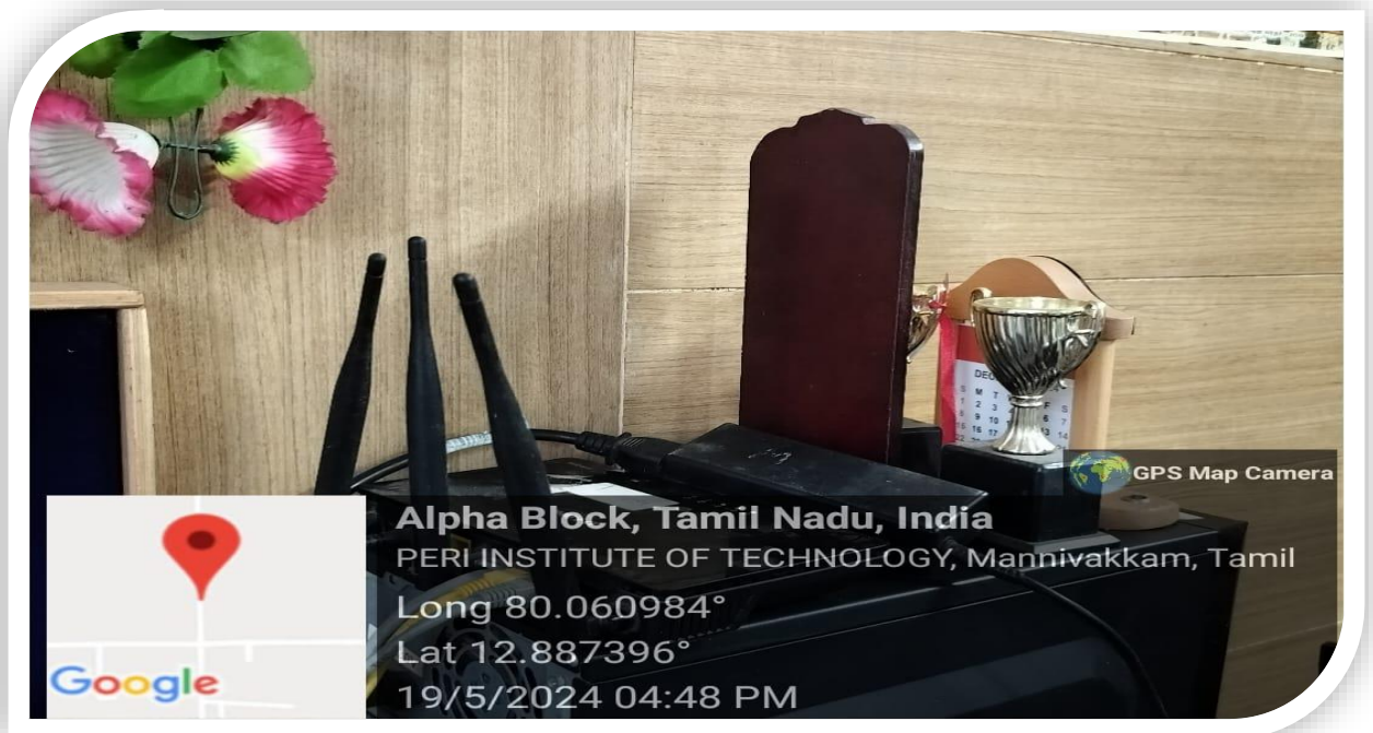
Wifi Connection - ALPHA BOCK