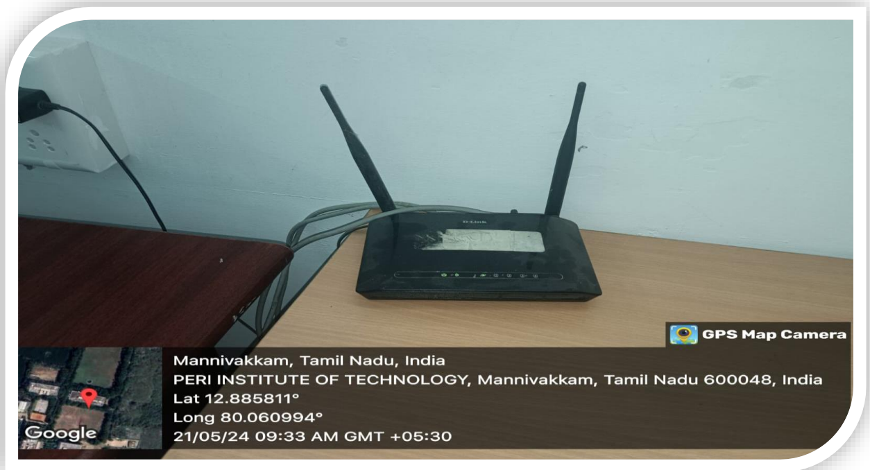
Wifi Connection - BETA BLOCK