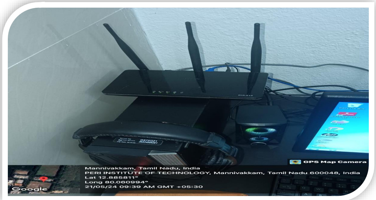
Wifi Connection – ALPHA BLOCK