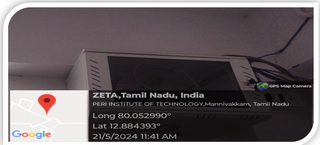
Wifi Connection - ZETA BLOCK